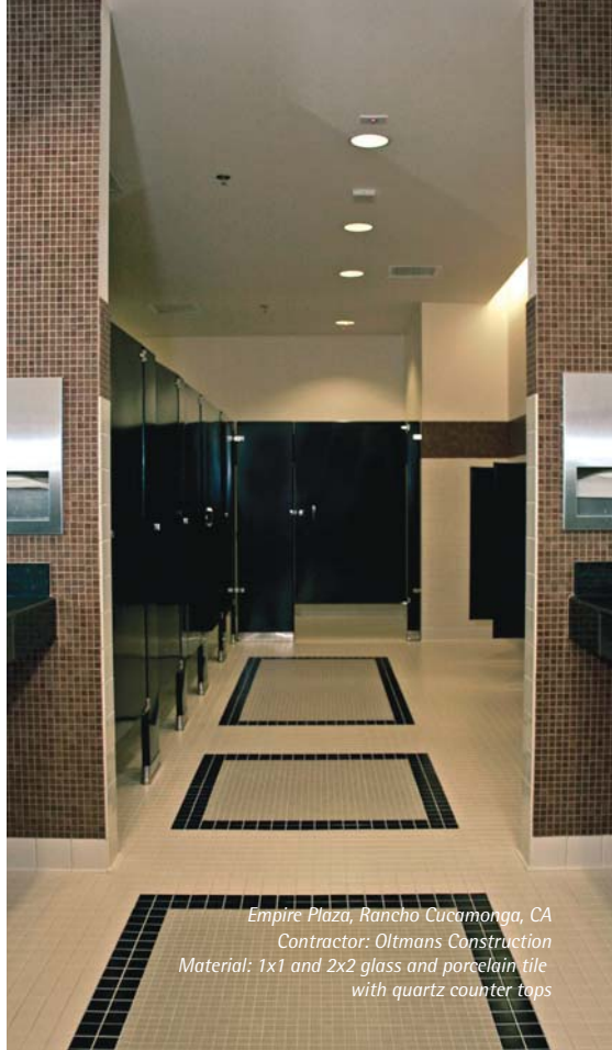
Empire Plaza, Rancho Cucamonga, CA Contractor: Oltmans Construction Material: 1x1 and 2x2 glass and porcelain tile with quartz counter tops