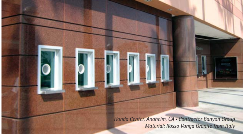
Honda Center, Anaheim, CA • Contractor Banyon Group Material: Rosso Vanga Granite from Italy

We're committed to earth-friendly products and fabrication practices. Our stonework is processed in a dust-free wet shop that incorporates an in-house water reclamation system. Eco-friendly low VOC cleaners and sealers as well as LEED certified