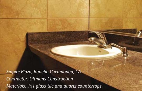
Empire Plaza, Rancho Cucamonga, CA Contractor: Oltmans Construction Materials: 1x1 glass tile and quartz countertops