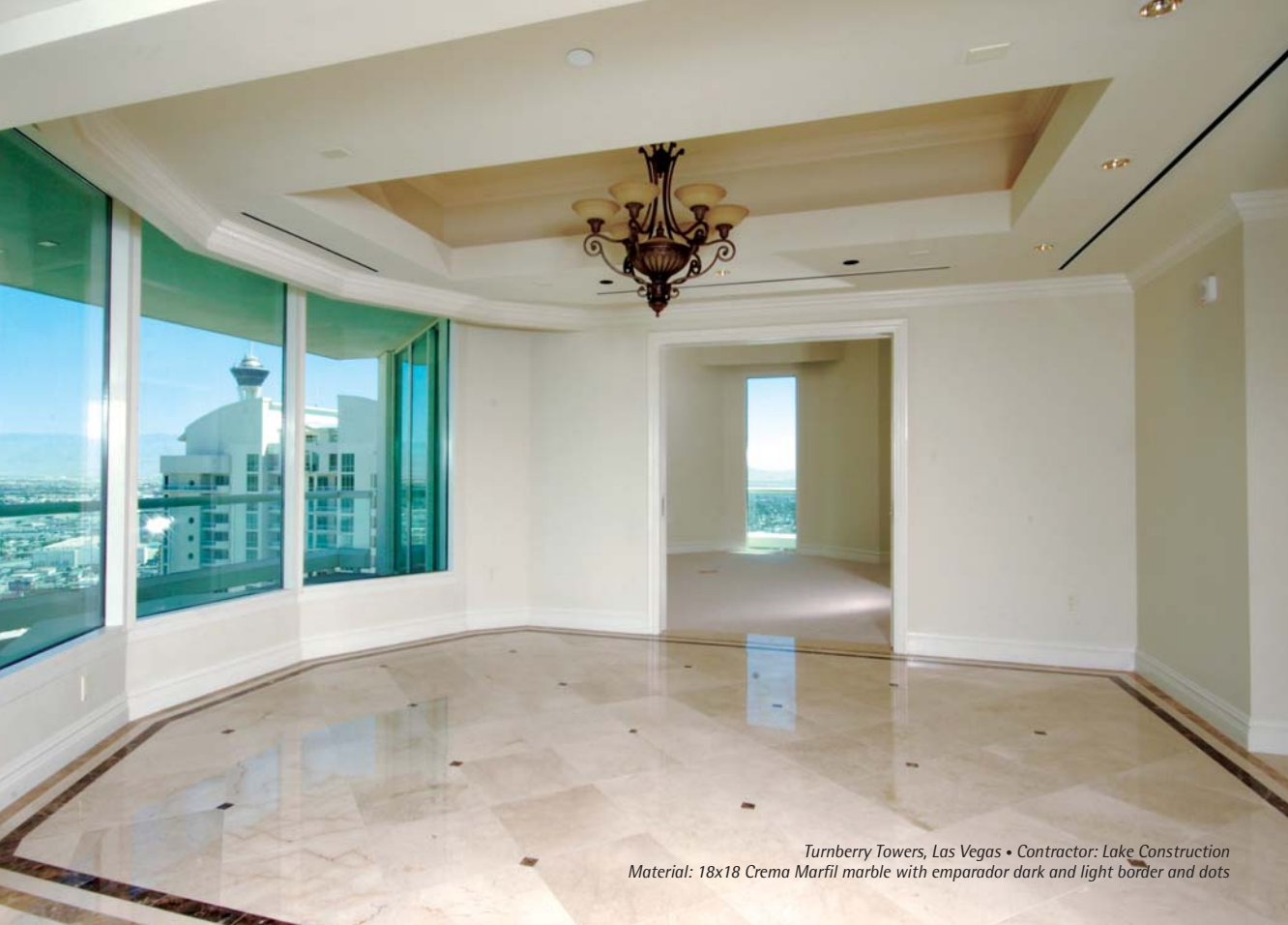
Turnberry Towers, Las Vegas • Contractor: Lake Construction Material: 18x18 Crema Marfil marble with emparador dark and light border and dots